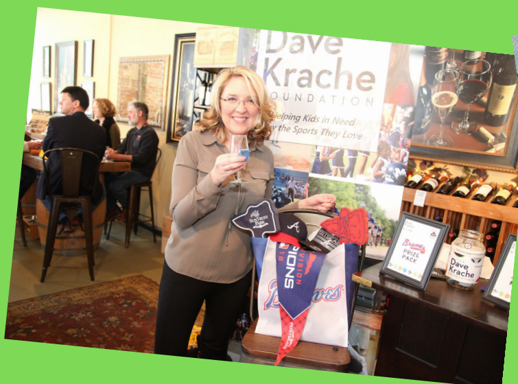
February: Sports & Wine, Marietta Wine Market