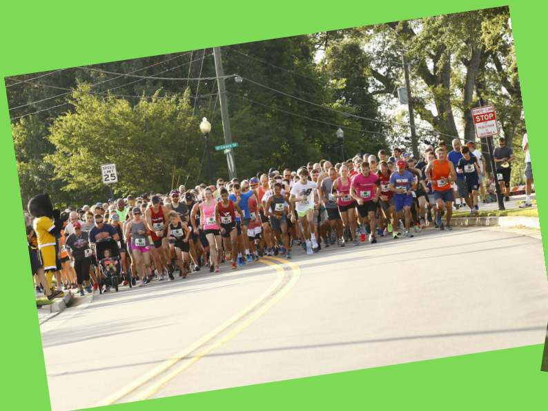
July: The Sports Fanatic 5K, part of the Kennesaw Grand Prix Race Series