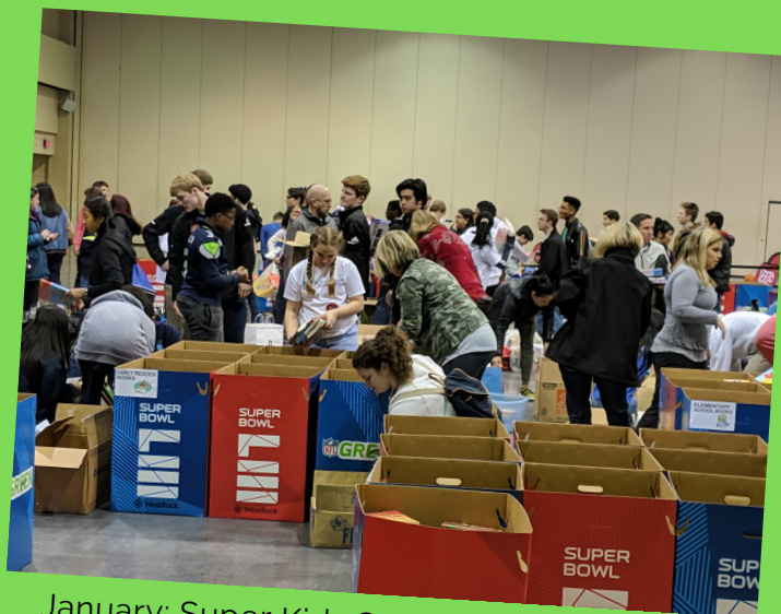
January: Super Kids Super Sharing event, hosted by the National Football League

Enjoy this recap of events that the DKF was a part of to spread its mission of keeping local kids in need playing the sports they love!