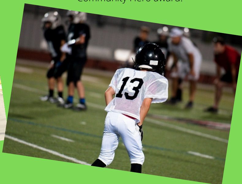
December: Giving Tuesday, a successful year of online fundraising to help keep kids in sports!