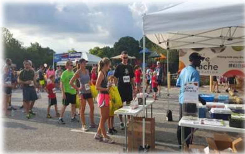
We handed out hundreds of smoothies to runners.

We passed out homemade smoothies at The Run for Wounded Heroes in downtown Kennesaw over the summer and participated in the first Gingerbread Competition hosted by the Junior League of Cobb-Marietta in November.