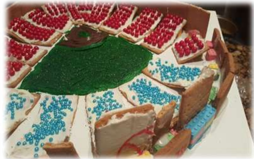
Our entry was a Gingerbread "Stadium," complete with SunTrust Park's logo and all!